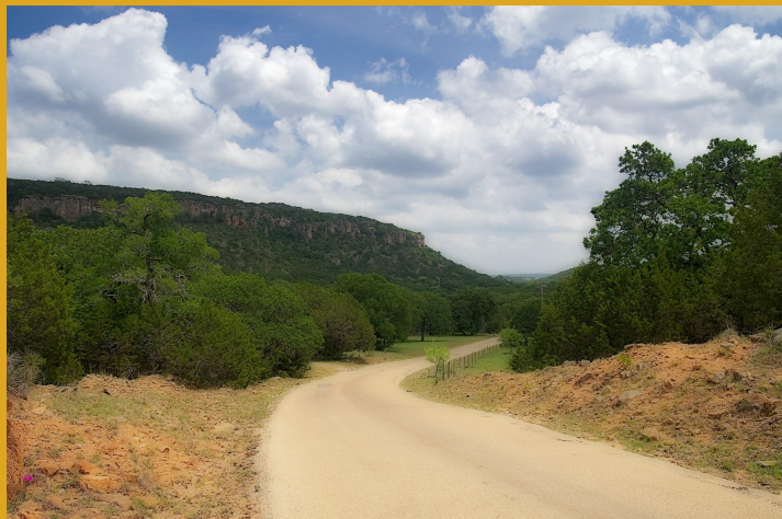
Texas Hill Country south of Ft. Cavazos.

Pack away or sell heavy winter gear. Seriously. You won't need it. The local governments don't even own snow plows!