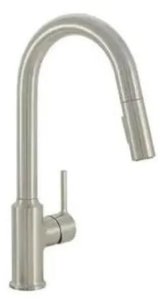
STANDARD PLUMBING IN BRUSHED NICKEL FINISHES