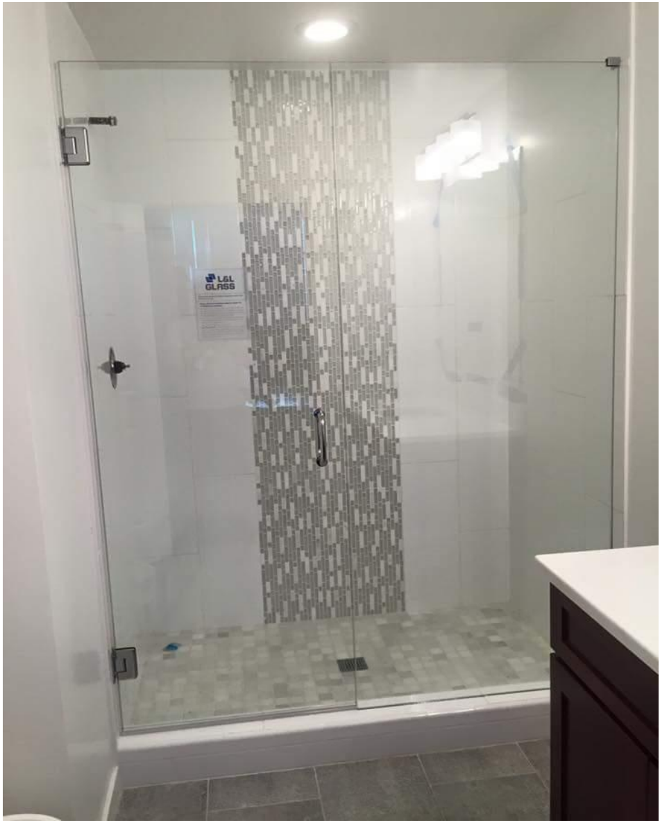
Seller reserves the right to substitute any product or material with that of equal quality.