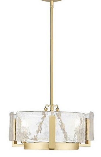
Stair Pendant C Unit

Seller reserves the right to Substitute any product of matchial with that of equal quality.