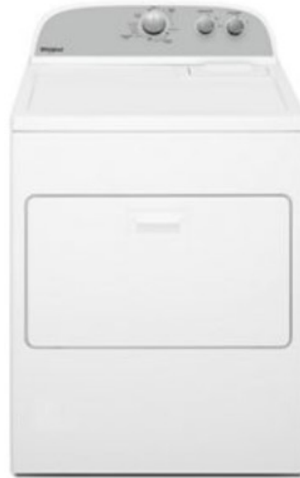
Whirlpool Dryer WED4950HW

7.0 cu. ft. Top Load Electric Dryer with AutoDry™ Drying System Care for the whole family's fabrics with this large capacity top load dryer. Choose between the AutoDry™ system, which helps prevent overdrying, or Timed Dry, which lets you manually control your drying schedule. Help keep wrinkles from setting in with the Wrinkle Shield™ option and easily transfer loads from the washer to this automatic dryer with a wide-opening hamper door.