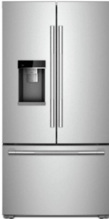
Jennair Counter Depth JFFCC72EHL

36 Inch Freestanding 3-Door French Door Smart Refrigerator with 23.8 Cu. Ft. Capacity, WiFi Connectivity, Exterior Water/Ice Dispenser, Automatic Ice Maker, Child Lock, Fresh Flow Air Filter, Theater LED Lighting, and Sabbath Mode External water/ice