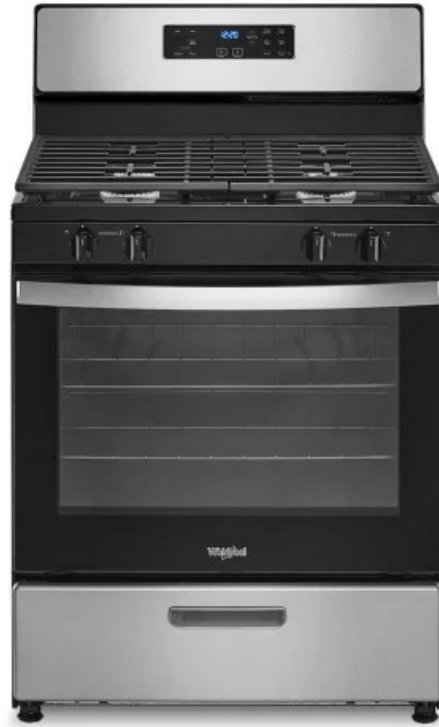
Whirlpool Gas Range WFG320M0MS

5.1 Cu. Ft. Freestanding Gas Range with Broiler Drawer Get the flexibility to cook a wide variety of meals with this freestanding gas range. Cook your family's favorite foods with help from Frozen Bake™ Technology, the built-in Broiler Drawer and more cooking modes. This gas stove has two high btu gas burners to sear and boil quickly, and edge to edge cooktop with cast-iron grates that are dishwasher safe