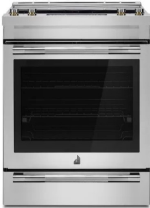
JennAir Electric Range JES1450ML