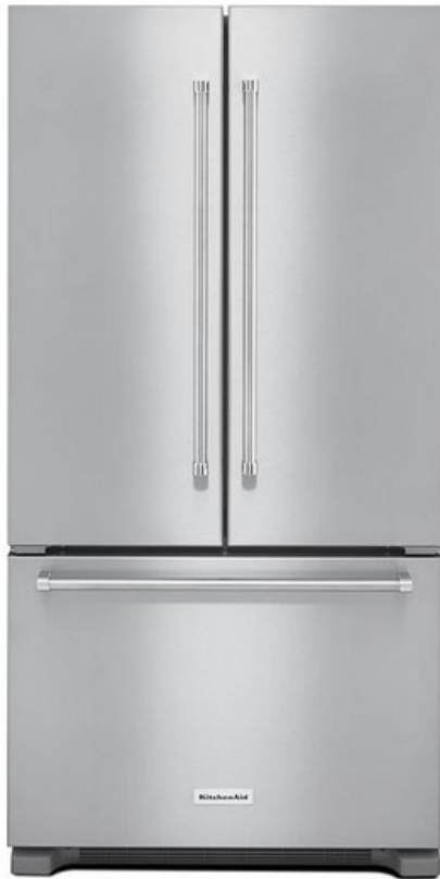
KitchenAid Counter Depth KRFC302ESS

22 cu. ft. 36-Inch Width Counter Depth French Door Refrigerator with Interior Dispense This 72-inch refrigerator is three inches taller than a standard counter-depth refrigerator. It fills the gap that can be left above many refrigerators, adding to its integrated appeal. A pull-out freezer drawer allows you to organize frozen items on three levels. And with the ExtendFresh™ Temperature Management System all of your ingredients will be held at the optimum temperature to maximize their flavor and texture.