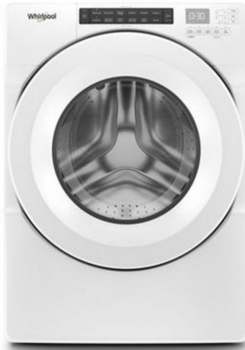
Whirlpool Top Load Washer WFW560CHW

4.3 cu. ft. Closet-Depth Front Load Washer with Intuitive Controls Match your family's routines and your space with a closet-depth front load washing machine that still offers plenty of room for bulky items at 4.3 cu. ft. capacity. Let the ENERGY STAR® Certified washer guide you to the right cycle combinations, like the Sanitize Cycle with Oxi, or customize up to 35 of your own with Intuitive Controls.