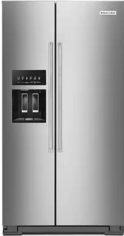
KitchenAid Std. Depth KRSC700HPS

24.8 cu ft. Side-by-Side Refrigerator with Exterior Ice and Water and PrintShield™ finish This 24.8 cu ft. side-by-side refrigerator features the Preserva® Food Care System. Its two independent cooling systems help keep food fresh while the FreshFlow™ Air Filter minimizes odors, and the Produce Preserver delays over-ripening. PrintShield™ Finish on the stainless steel exterior resists fingerprints and smudges for easy cleaning. External water/ice