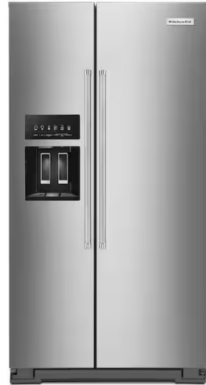
KitchenAid Counter Depth KRSC700HPS

24.8 cu ft. Side-by-Side Refrigerator with Exterior Ice and Water and PrintShield™ finish This 24.8 cu ft. side-by-side refrigerator features the Preserva® Food Care System. Its two independent cooling systems help keep food fresh while the FreshFlow™ Air Filter minimizes odors, and the Produce Preserver delays over-ripening. PrintShield™ Finish on the stainless steel exterior resists fingerprints and smudges for easy cleaning. External water/ice