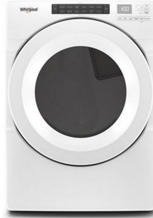
Whirlpool Dryer WED5620HW

4.3 cu. ft. Closet-Depth Front Load Washer with Intuitive Controls Match your family's routines and your space with a closet-depth front load washing machine that still offers plenty of room for bulky items at 4.3 cu. ft. capacity. Let the ENERGY STAR® Certified washer guide you to the right cycle combinations, like the Sanitize Cycle with Oxi, or customize up to 35 of your own with Intuitive Controls.