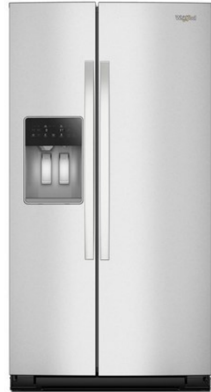
Whirlpool Counter Depth WRS315SNHM

TruCool™ System, In-Door Ice & Water, Adjustable Glass Shelves, Deli Drawer, Adaptive Defrost, and ADA Compliant: Fingerprint Resistant Stainless Steel