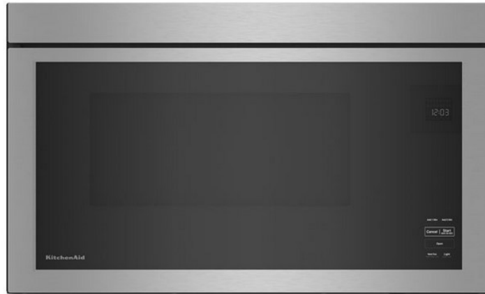
KitchenAid Over the Range Microwave KMMF330PPS

30-Inch 5-Element Electric Convection Range This versatile electric freestanding range produces flawless cooking results with Even-Heat™ True Convection. The unique bow-tie design and convection fan ensure the inside of the entire oven is heated to, and stays at, the perfect temperature. The cooktop features five heating surfaces, including a dedicated warming zone, allowing you to do more on your range.