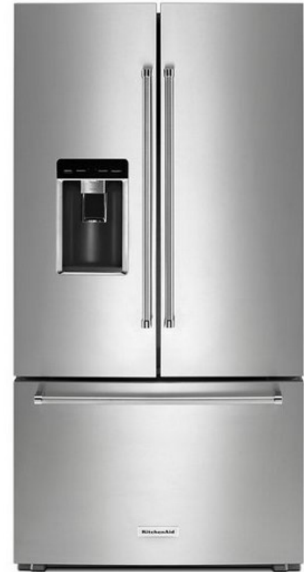
KitchenAid Counter Depth KRFC704FPS

22 cu. ft. 36-Inch Width Counter Depth French Door Refrigerator with Interior Dispense This 72-inch refrigerator is three inches taller than a standard counter-depth refrigerator. It fills the gap that can be left above many refrigerators, adding to its integrated appeal. A pull-out freezer drawer allows you to organize frozen items on three levels. And with the ExtendFresh™ Temperature Management System all of your ingredients will be held at the optimum temperature to maximize their flavor and texture.