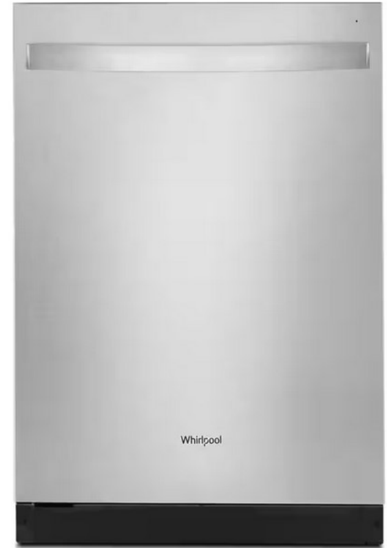
Whirlpool Tall Tub Dishwasher WDT730HAMZ

1.9 cu. ft. Capacity Steam Microwave with Sensor Cooking This Whirlpool® microwave has convenient features that are easy to use no matter who's doing the cooking. Our sensor cooking microwave automatically adjusts cooking times so there's no need to guess. Free up cooktop space by steaming foods in the microwave and get quick cleanup with a CleanRelease® non-stick interior.