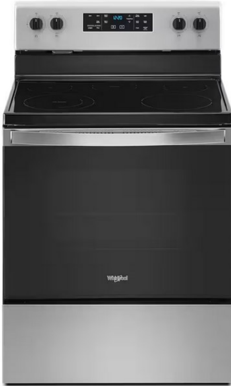
Whirlpool Free Standing Electric Range WFE505W0JS

5.3 cu. ft. Whirlpool® electric range with Frozen Bake™ technology This Whirlpool® electric range with a dual element stove top resists fingerprints and helps you get dinner to the table. Skip preheating for favorites like pizza with Frozen Bake™ technology. This steam cleaning oven also prevents cooked food from getting cold with a Warm Zone on the cooktop and the Keep Warm setting in the oven.