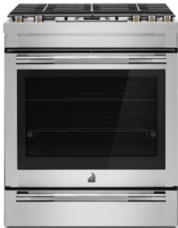
JennAir Gas Range JGS1450ML

6.8 Cu. Ft. Total Capacity, Continuous Cast Iron Grates, Baking Drawer, Glide Oven Racks, Dual-Stacked PowerBurner, True Convection, DuraFinish™ Protection, Die-Cast Metal Knobs, Halogen Lighting, AquaLift® Self-Cleaning, Emotive Controls, Air Fry, LP Kit Included and Sabbath Mode: Gas