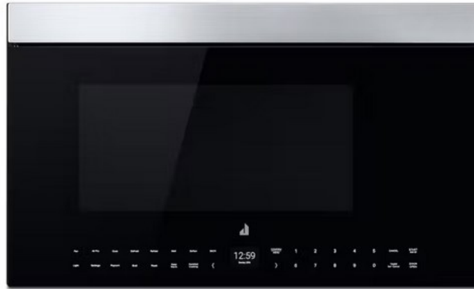
JennAir Over the Range Microwave JMHF730RBL

Revel in the power and flexibility of a JennAir® electric slide-in range. Saute and simmer on the Triple-Choice Element, and cook multiple dishes on multiple racks in the 6.8 cu. ft. oven cavity then slow roast or proof bread in the separate Baking Drawer. True convection steady heat circulates around every rack by whirling metal blades. Robust, die-cast metal knobs offer precise control and cooperate with the design of the range.