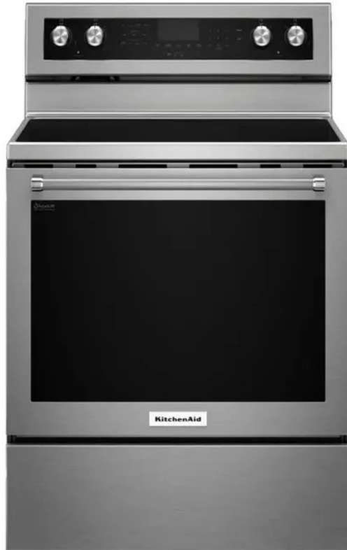
KitchenAid Electric Range KFE500ESS

30-Inch 5-Element Electric Convection Range This versatile electric freestanding range produces flawless cooking results with Even-Heat™ True Convection. The unique bow-tie design and convection fan ensure the inside of the entire oven is heated to, and stays at, the perfect temperature. The cooktop features five heating surfaces, including a dedicated warming zone, allowing you to do more on your range.