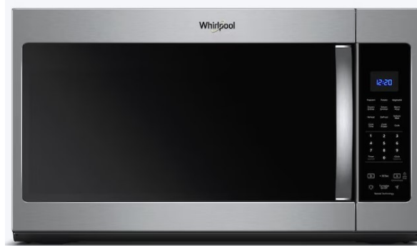
Whirlpool Over the Range Microwave WMH32519HZ

5.3 cu. ft. Whirlpool® electric range with Frozen Bake™ technology This Whirlpool® electric range with a dual element stove top resists fingerprints and helps you get dinner to the table. Skip preheating for favorites like pizza with Frozen Bake™ technology. This steam cleaning oven also prevents cooked food from getting cold with a Warm Zone on the cooktop and the Keep Warm setting in the oven.