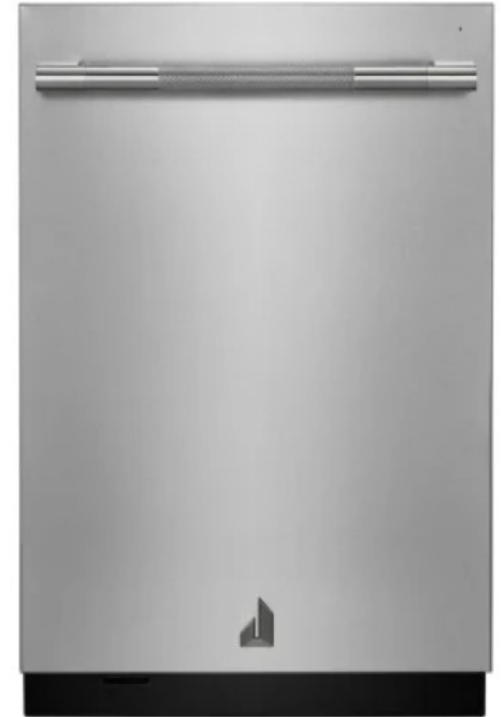
JennAir Tall Tub Dishwasher JDPSS244PL