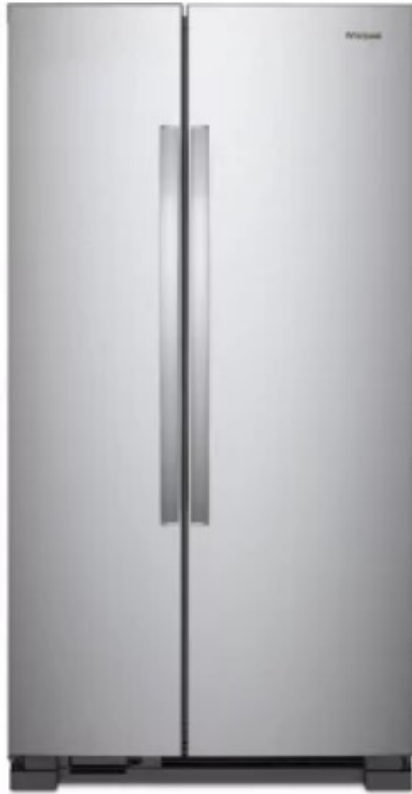
Whirlpool Std. Depth WRS315SNHM

Purposefully-designed storage spaces help you fit and find it all. Get increased loading flexibility with adjustable gallon door bins. LED lights keep food looking as good as it tastes while electronic controls make it easy to adjust your refrigerator whenever it's needed.