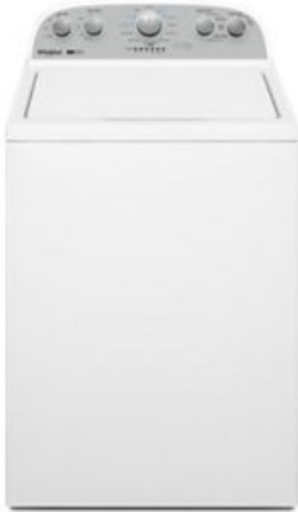
Whirlpool Top Load Washer WTW4957PW