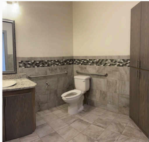
2 ADA Bathrooms