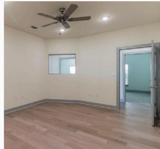
Reception and Lobby