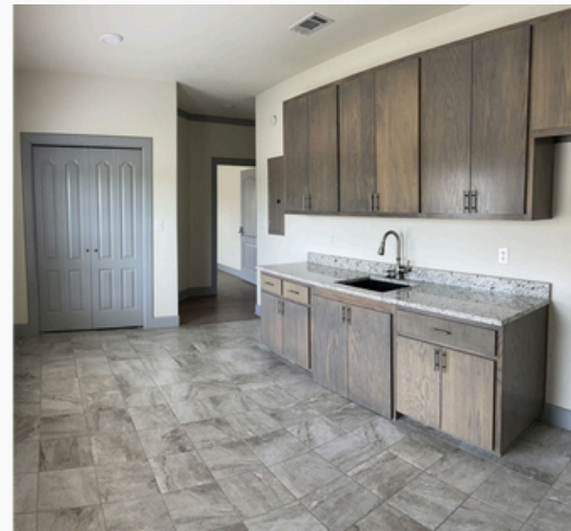
Full Build Out